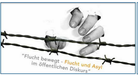
Flight Moves: Flight and asylum in public discourse

This project is designed to help refugees get oriented in the Austrian job market. Students work on a concept to provide information on Austrian labor law, business practices and conventions, and the education system. Providing a platform that connects various stakeholders in the process of preparing refugees for the Austrian labor market, the project is an important contribution to the integration of refugees.