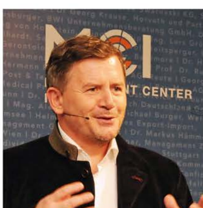
Development & sustainable economy.

Romano Prodi, former Prime Minister of Italy and President of the European Commission