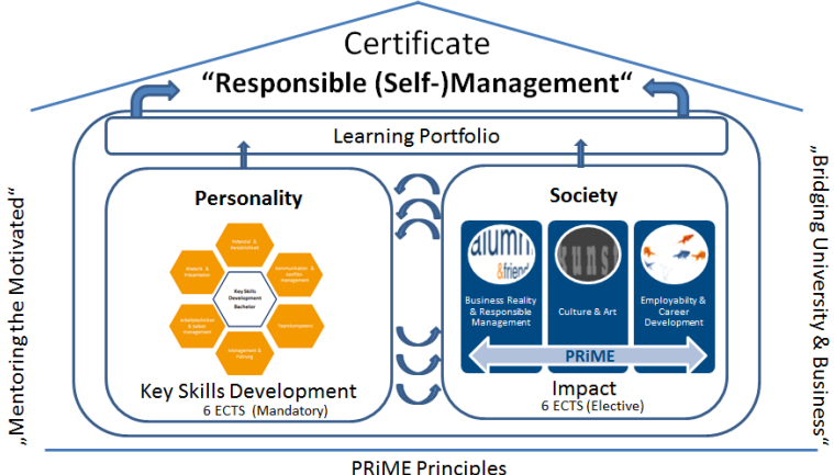
Principles of Responsible Management Education

The program "Responsible (Self-)Management" was launched by the Department for Industrial Engineering & Management in winter term 2014/15 for bachelor students, and has seen its first graduates in 2017. The three-year program offers students the possibility to gain an additional certificate in "Responsible (Self-)Management" by attending curricular and extracurricular seminars and learning events. In addition courses within the curriculum focused on transversal skills, students attend extra lectures and events which cover topics such as business ethics, Corporate Social Responsibility, sustainability, culture, and arts. In order to help students develop reflective skills throughout this learning effort, they are required to document their learnings in an ePortfolio throughout the duration of the program. The ePortfolio contains their individual reflections related to personal development and their growing awareness of responsibility in their future professional roles. The focus is on building an attitude and a mindset of responsibility in order to address the growing challenges of a fast-moving and highly complex world. 20% of all students in the program completed the program and received the first certificates in summer 2017.