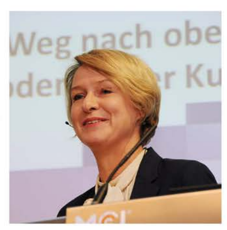
Women on their way to the top.